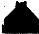
Blower Unit w/ NiMH or LiSO2 Battery Integrated