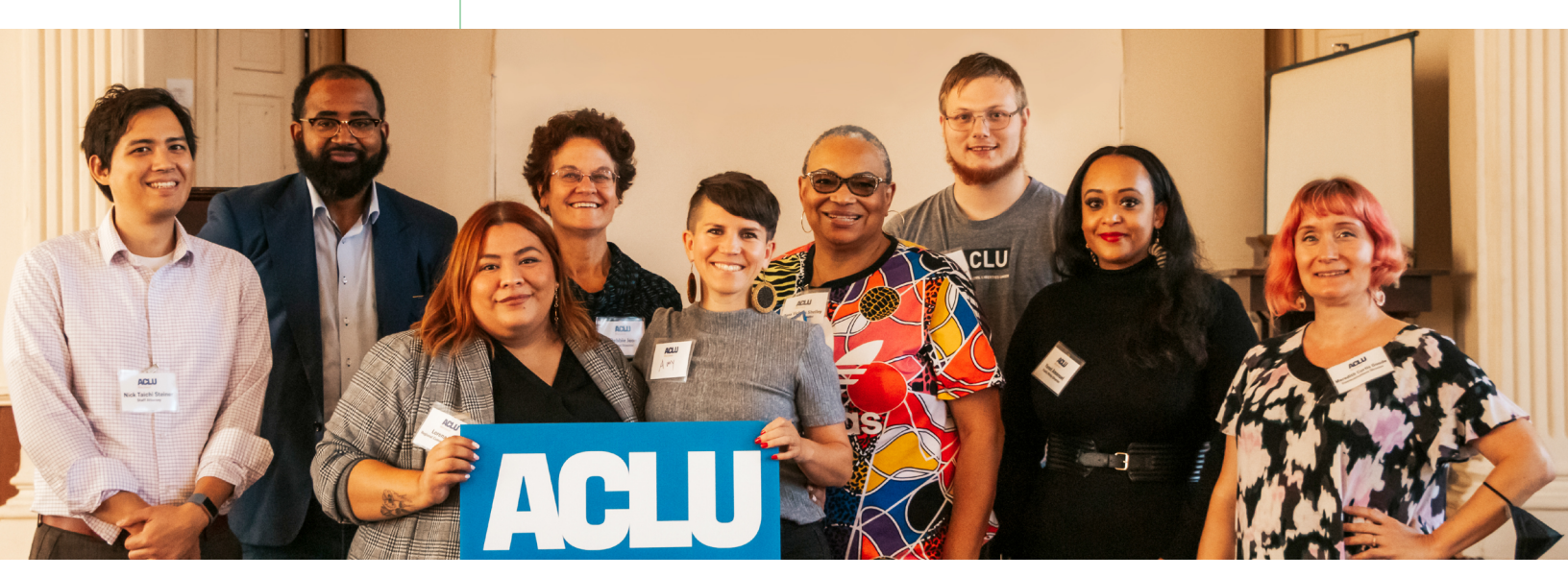
Our victories are made possible by the courageous and generous contributions of our clients, plaintiffs, volunteers, member-donors, staff, and board of directors. The ACLU of Maryland does not endorse or approve third-party fundraisers. Thank you for contributing so that we can keep up the good work.

ACLU-MD serves all Marylanders whose civil rights and civil liberties have been violated. We focus on supporting Black and Brown people and people from other communities systemically threatened by white supremacy, with the goal of addressing systemic oppression and rights violations. We are accountable to directly impacted communities and individuals, and we follow their lead in setting goals and designing our work. We are a statewide organization with ligation, public policy advocacy, and organizing efforts that span Maryland.