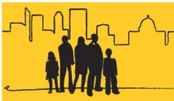
BALTIMORE EDUCATION COALITION