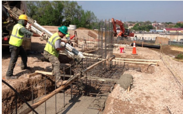
Foundation work for the new addition at Frederick Elementary School in west Baltimore

It has been three years since the ACLU, Baltimore Education Coalition, BUILD, Strong City Baltimore and many other groups launched the Transform Baltimore: Build Schools, Build Neighborhoods campaign, rallied elected officials, and won the $1 billion school construction bill in Annapolis - funding Phase I of the 21st Century Schools program.