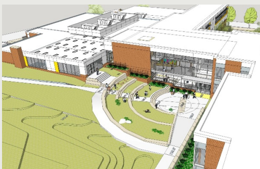
John Eager Howard Elementary's plan includes renovation of the existing school building, adding a 2-story addition, and an outdoor classroom.